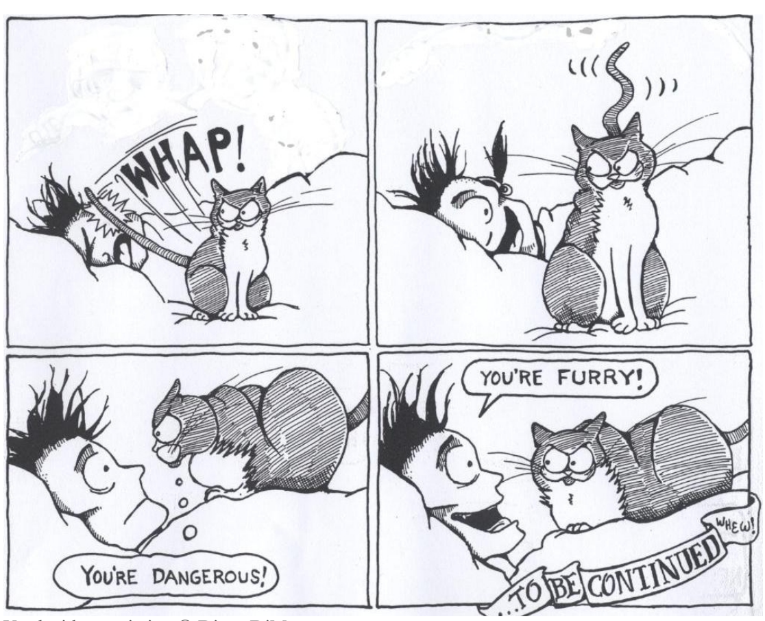
Used with permission © Diane DiMassa

freedom, unbound by usual restrictions of taste; comic illustration, with its ability to go beyond acceptability, is hence an ideal medium for its message. Hothead Paisan belongs gleefully to queer gothic, or splatterpunk in its willingness to portray forbidden behaviours and shock its readers as she lurches from one brawl to another. But Hothead Paisan is a difficult and psychotic character, maniacally fuelled by TV and coffee, she is as much the victimised as the tormenter, and these 'zines portray her acute damage from homophobia as much as they document her resistance. She is the angry lesbian wound.