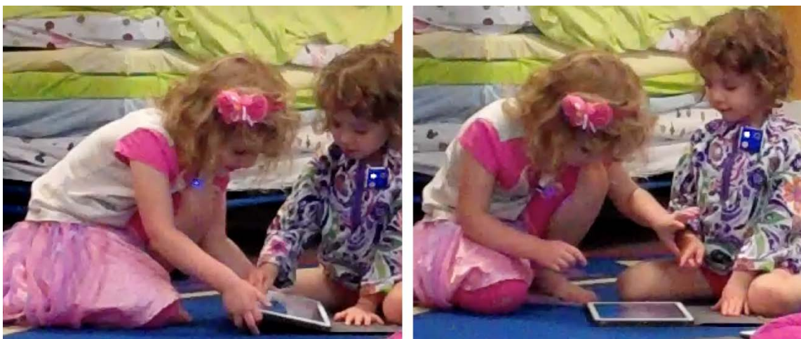
Figure 5. Participant 3 exhibiting antisocial behaviours.

the screen and said, “No, no, no. I want to do it. You do this!” Participant 4 said, “No!” in response. This led to Participant 3 saying “No, no, no, no. No! I want to do it.”