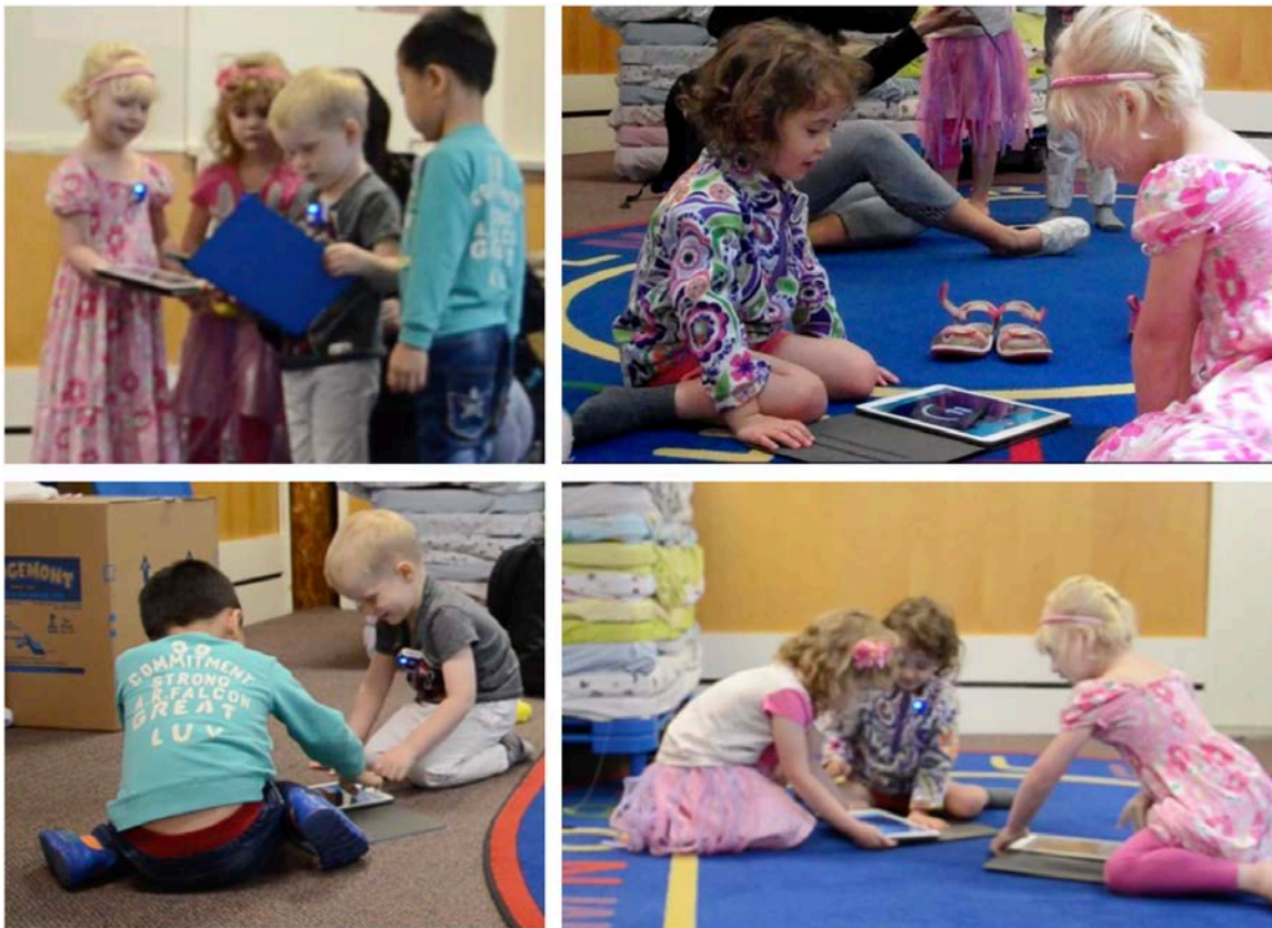
Figure 2. Participants sharing iPads

antisocial behaviours have a negative connotation and sometimes the children would work alone, not to be antisocial or isolated, but rather to work independently. Prosocial behaviours included all of the positive sharing events in which the children would share. For finer grained qualitative data analysis, these three main event codes were divided into subcodes (Table 2).