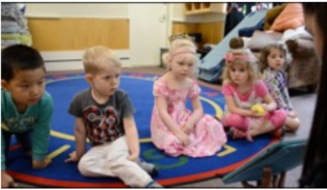
Figure 1. Participants reading an iPad story with the researcher.