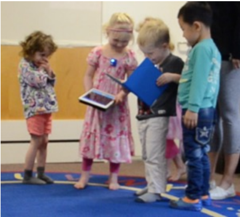
Figure 6. All participants laughing while Participant 4 covers her face