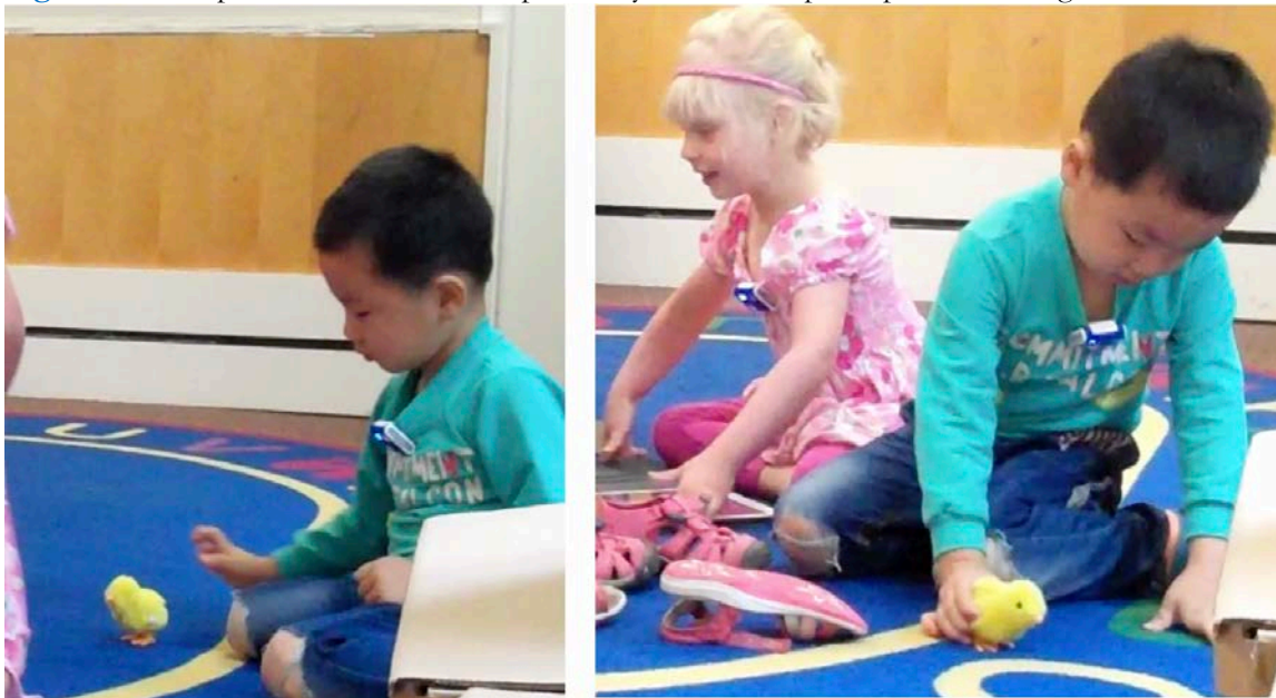
Figure 4. Participant 5 playing with other toys