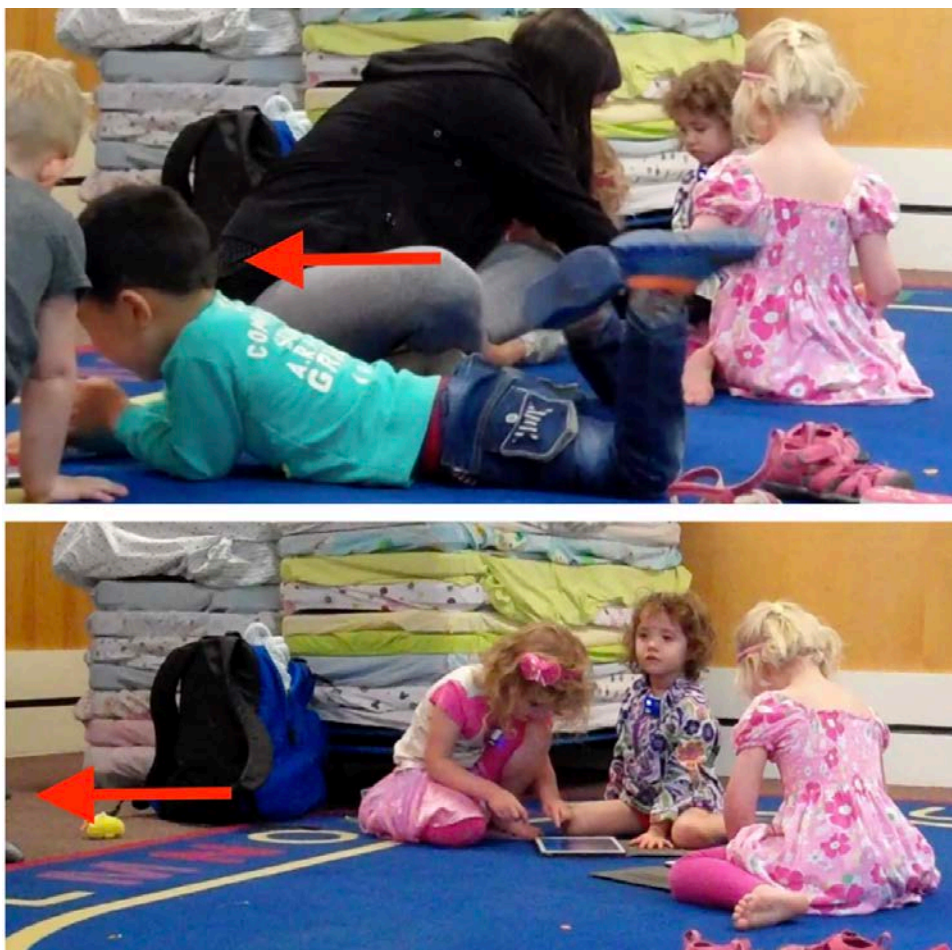
Figure 9. Participants 2 and 5 move out of researcher camera shot