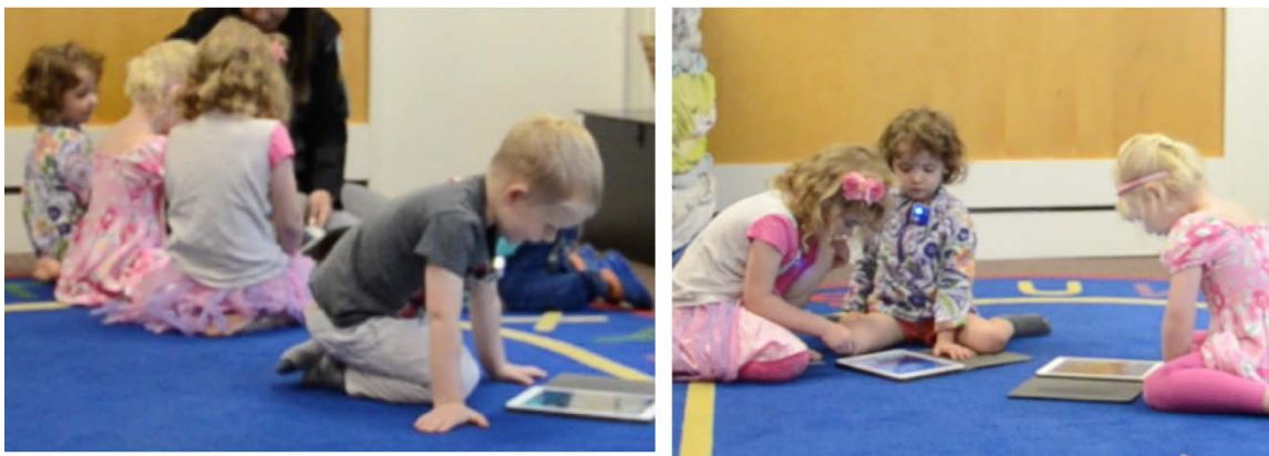
Figure 3. Participants 1 and 2 work independently while other participants work together.