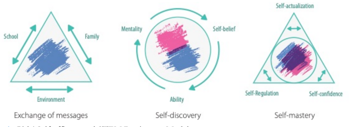
Figure 1. Girls' Self-efficacy and STEM Persistence Model

each variable influences the others. His framework emphasizes an interaction among behavior, environment, and person/cognition. The inquiry into Bandura's social cognitive theory has created numerous questions. It should be noted, however, that his literature does not explicitly define self-efficacy among girls or its influence on the lives of adult women.