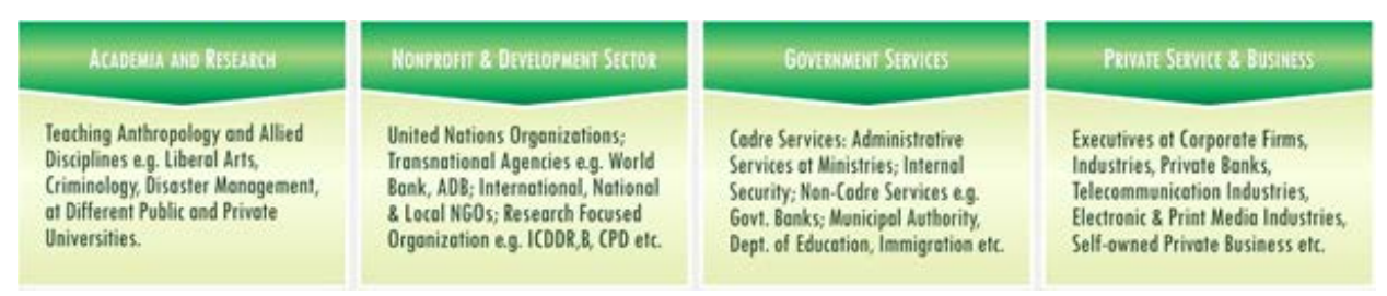
Figure 3. Major employment for Anthropology graduates in Bangladesh

to poverty, livelihood and development. Apart from the major research areas graphed above, students of all the universities have also conducted research on issues like gerontology, film and media, folklore, historical construction, tourism industry, ship-breaking industry etc. which have been grouped under a separate category titled as 'other'.