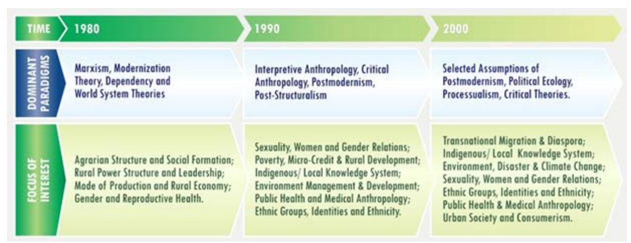
Figure 1. The transformation of research interests in Anthropology of Bangladesh from 1980 to 2010