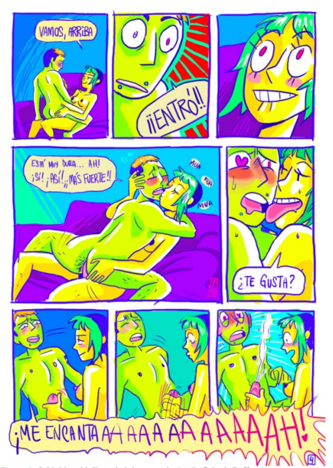
Figure 5. Si Me Mojás Me Enciendo. Sukermercado (2017). © Paula Boffo.

romantic story with an underlying porn structure: she can fuck everyone, but she finds a trans boy that she likes and she gets nervous, clumsy, she runs into him when she's in her pyjamas buying stuff at the supermarket. Things like that.