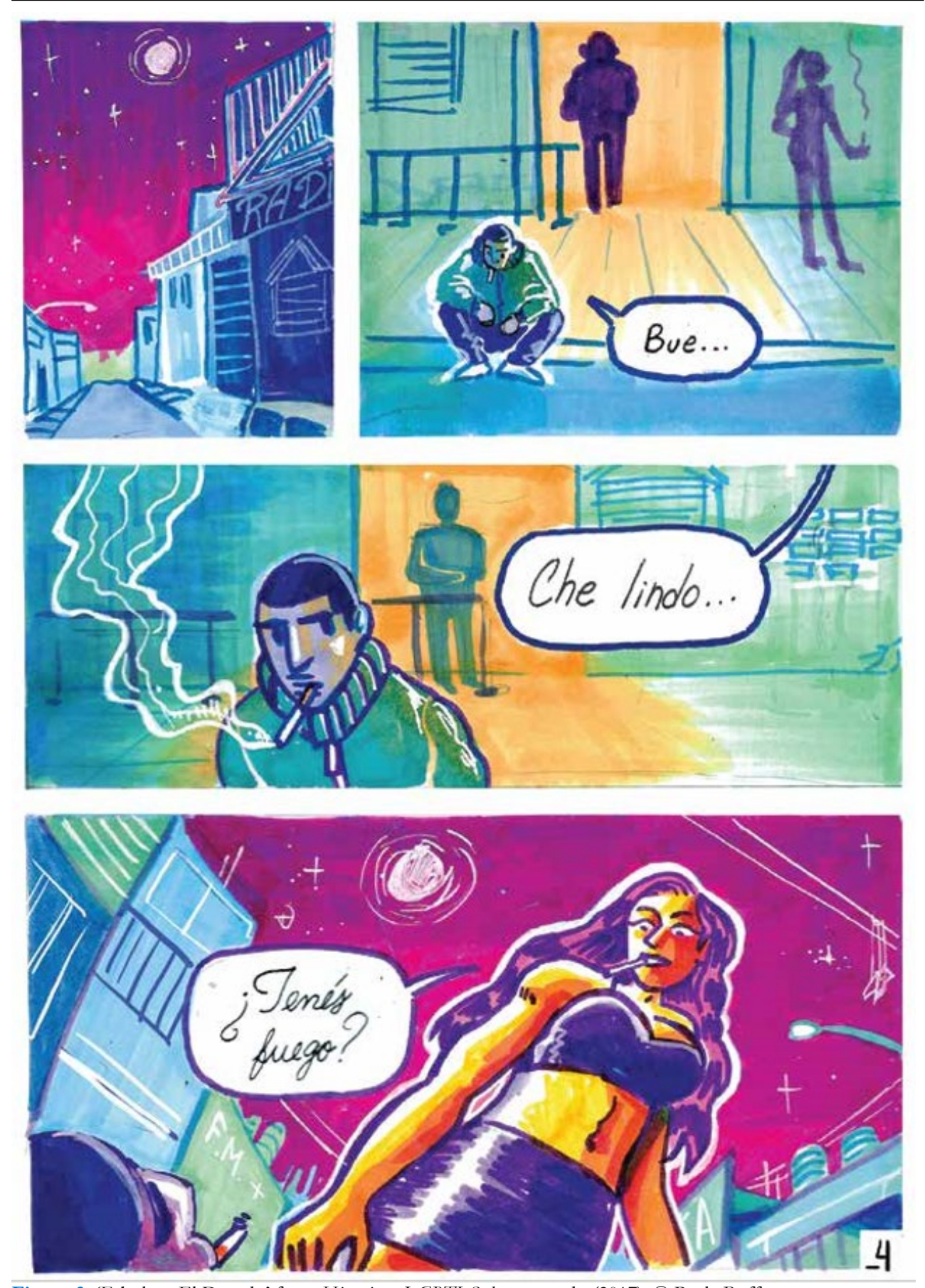
Figure 3. 'Fabulosa El Dorado' from Historietas LGBTI. Sukermercado (2017). © Paula Boffo