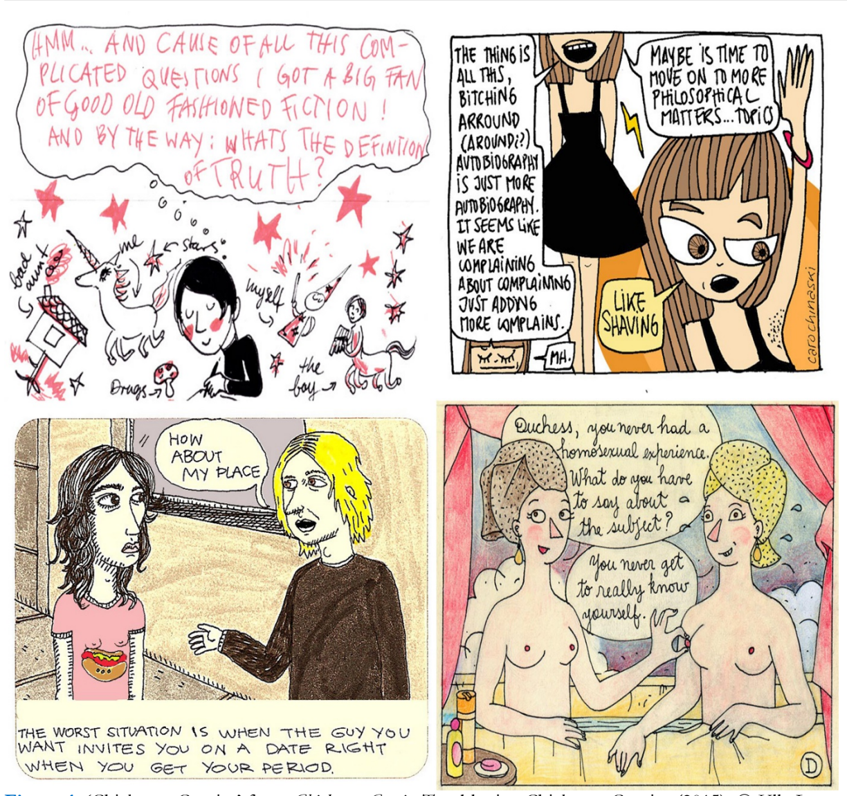
Figure 1. 'Chicks on Comics' from Chicks on Comics Tumblr site. Chicks on Comics (2015). © Ulla Logue, Caro Chinaski, Delius, Powerpaola.

Tell us about your beginnings as a cartoonist.