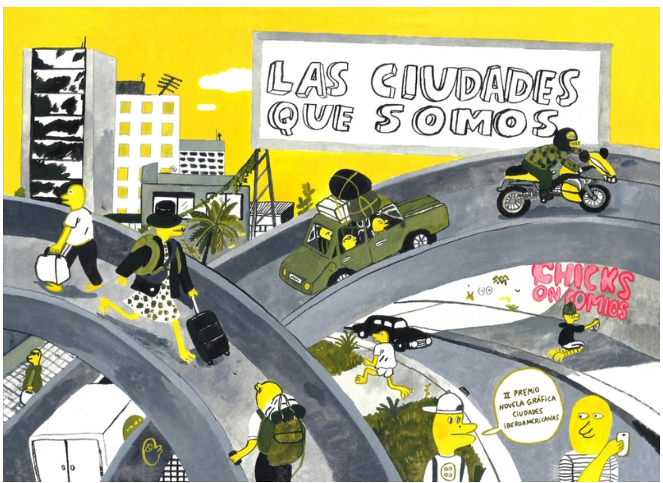
Figure 6. Cover for Las Ciudades Que Somos. Powerpaola (2019). © Chicks on Comics.

Caro Chinaski : "The plane ticket, the train ticket, and also the 'memory ticket' that comes from our recollections. We are all passengers who go to a place."