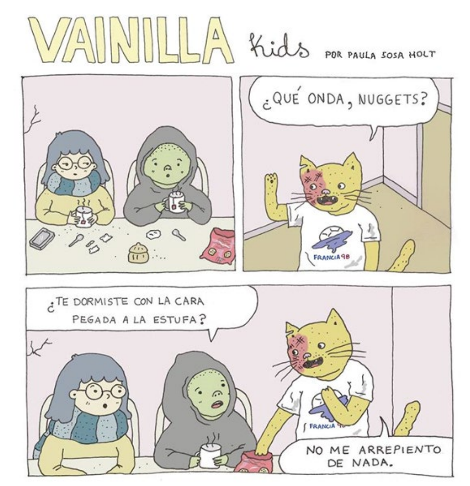
Figure 8. Vainilla Kids. Paula Sosa Holt (2018). © Paula Sosa Holt.

Do you include the dialogues in those notes? Or the dialogues come afterwards?