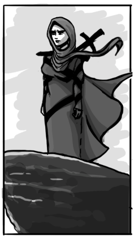
Figure 2. Mohammed, D. (2013). Qahera the Superhero, Egypt, Tumblr, June 30th, 2013. © D. Mohammed.

Duncan is not the only scholar to note the uniqueness of comics in deconstructing the veil, and orientalism/Islamophobia. Gillian Whitlock also discusses veiling when she analyses Persepolis in her chapter 'Autographics' in her book Soft weapons (2007). When examining the use of the veil in Satrapi's schoolyard playground, Whitlock remarks on its triviality to young Muslim girls when Satrapi and her peers use it as a toy to play skipping, rather seeing it as a 'piece of cloth, and its fetishization by adults can seem strange' (Whitlock, 2007: 190). This kind of critical intervention is novel for it treats the veil as an insignificant artefact of no real importance which is a perspective that is rarely ever communicated in popular culture. Similarly, Qahera seems to reduce this over-worked cultural symbol, as to her it is only useful in the superhero wardrobe. The costume does not wear the character but rather the other way around, unlike the case with Dust.