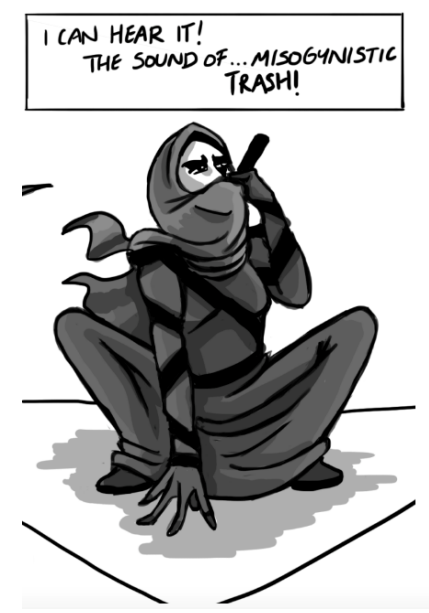
Figure 7. Mohammed, D. (2013). Qahera the Superhero, Egypt, Tumblr, June 30th, 2013. © D. Mohammed.

misconceptions of the veil and Muslim women's representation but also potentially a learning space for them. For Muslim audiences in the west, it can function more as a space for solidarity. And for Egyptian audiences, it can function as a space for both familiarity and solidarity for specific political themes such as the refugee crisis in 2015.