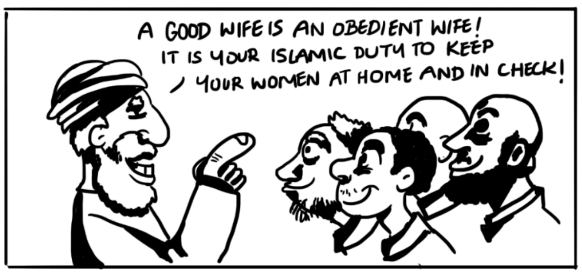
Figure 3. Mohammed, D. (2013). Qahera the Superhero, Egypt, Tumblr, June 30th, 2013. © D. Mohammed.

Qahera is an allegory that synchronises the hybridity of text and images closely together. In 'Part 1: Brainstorm', the comic starts off with the veiled superheroine denoting 'misogynistic trash' with her supersonic ears before a comic panel cuts to a cleric telling a group of men that the best wife is an obedient wife (Mohammed, 2013). Soon after Qahera attacks the surprised cleric and hangs him on a clothesline with two laundry clips before telling him that he's right that 'housework is women's work absolutely' (Mohammed, 2013). As noted in 'Part 10: On basic equality and such', she pokes fun at an ignorant bystander who insults her incessantly. It ends with her saving someone who looks like him with him finally giving his nod of approval. The point of the comic is to make jest out of conservative Muslim masculinity. Qahera is often regarded as satirical for this reason.