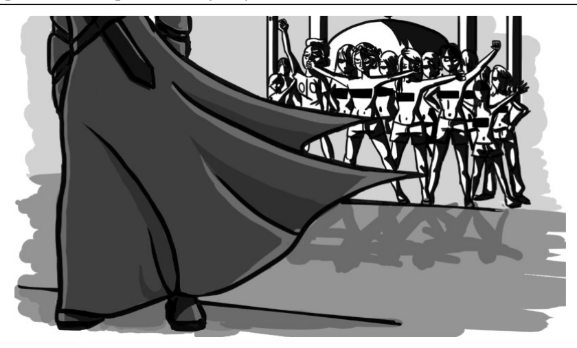
Figure 4. Mohammed, D. (2013). Qahera the Superhero, Egypt, Tumblr, July 20th, 2013. © D. Mohammed.

In the FEMEN comic the creator appears to draw a direct allusion to Wonder Woman, a feminist superhero who has also faced criticism for being too sexualised, as indicated in the UN's brief choice for Wonder Woman as an ambassador for the empowerment of women and girls for which they faced intense backlash for choosing an icon that was decidedly too sexualised. After protests and an online petition was launched, the decision to use her as an icon was rescinded (Ross, 2016). A hallmark weapon of Wonder Woman is her magic lasso, so when in the FEMEN comic Qahera uses her sash as a make-do lasso to capture the FEMEN protestors, this allusion appears deliberately intertextual. Another interpretation of Qahera's ad-hoc lasso can be to suggest a sense of solidarity with other iconic female superheroes and an attempt to indigenise the superheroine trope to an Egyptian Muslim audience. From this angle, the comic can be read as one that builds solidarity with feminist allies. (It is also quite possible that the comic was providing commentary on the policing of women's choices in dress as well.)