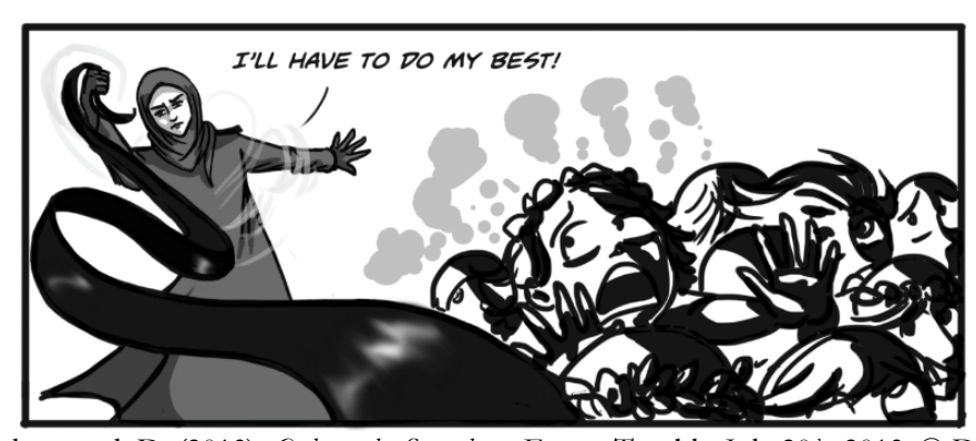
Figure 5. Mohammed, D. (2013). Qahera the Superhero, Egypt, Tumblr, July 20th, 2013. © D. Mohammed.

In the FEMEN comic the creator appears to draw a direct allusion to Wonder Woman, a feminist superhero who has also faced criticism for being too sexualised, as indicated in the UN's brief choice for Wonder Woman as an ambassador for the empowerment of women and girls for which they faced intense backlash for choosing an icon that was decidedly too sexualised. After protests and an online petition was launched, the decision to use her as an icon was rescinded (Ross, 2016). A hallmark weapon of Wonder Woman is her magic lasso, so when in the FEMEN comic Qahera uses her sash as a make-do lasso to capture the FEMEN protestors, this allusion appears deliberately intertextual. Another interpretation of Qahera's ad-hoc lasso can be to suggest a sense of solidarity with other iconic female superheroes and an attempt to indigenise the superheroine trope to an Egyptian Muslim audience. From this angle, the comic can be read as one that builds solidarity with feminist allies. (It is also quite possible that the comic was providing commentary on the policing of women's choices in dress as well.)